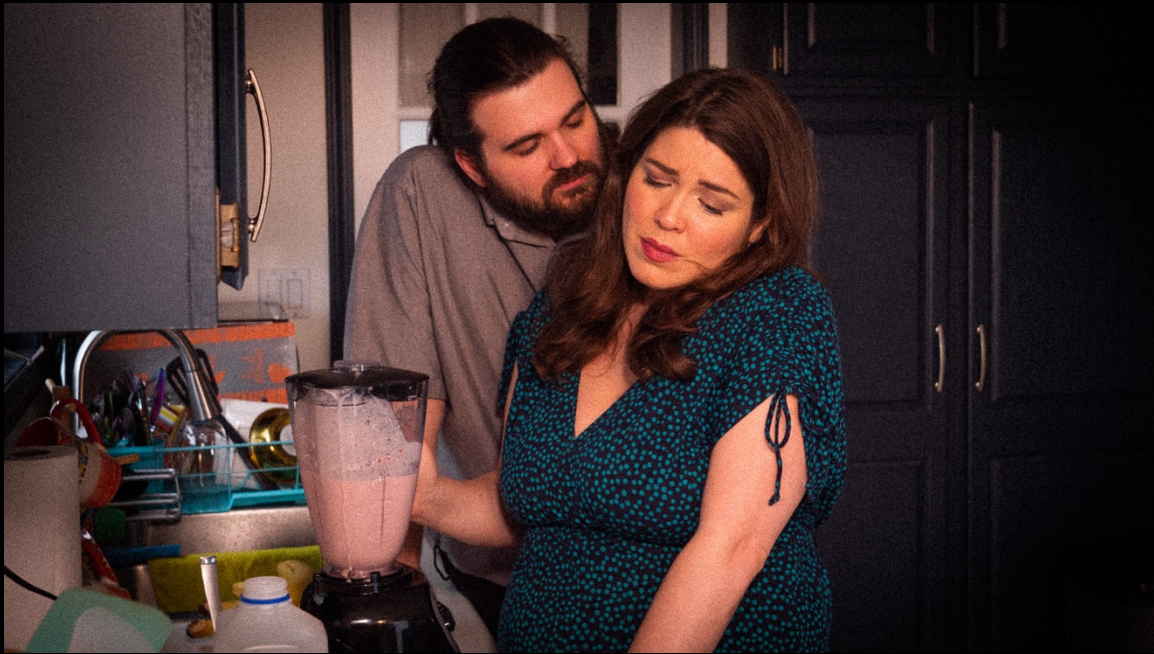
Cindy spurns John's affections, uncomfortable with his friendliness with The Sock.