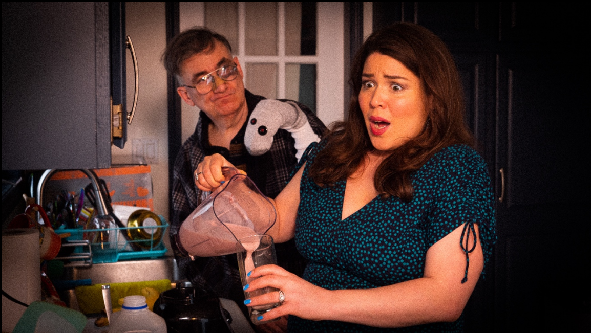
The Sock sneaks up on Cindy.