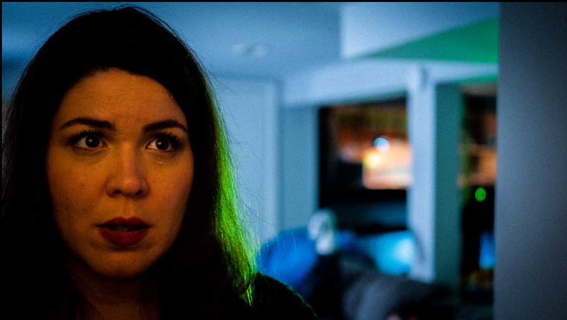
The Sock keeps its button eyes on Cindy.