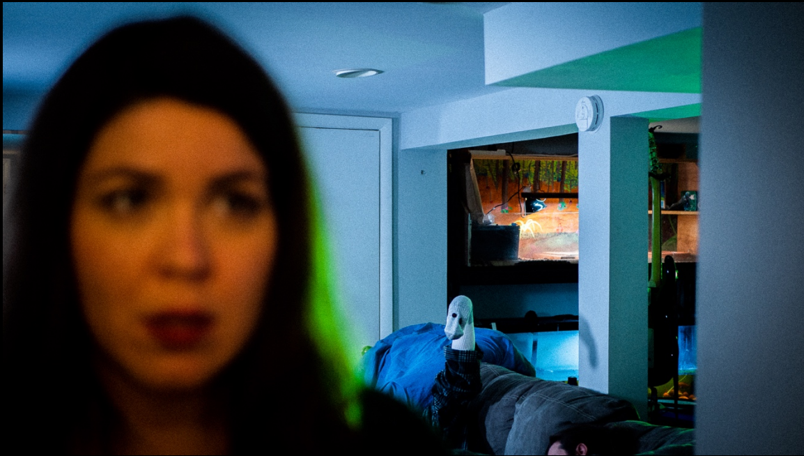
The Sock keeps its button eyes on Cindy.