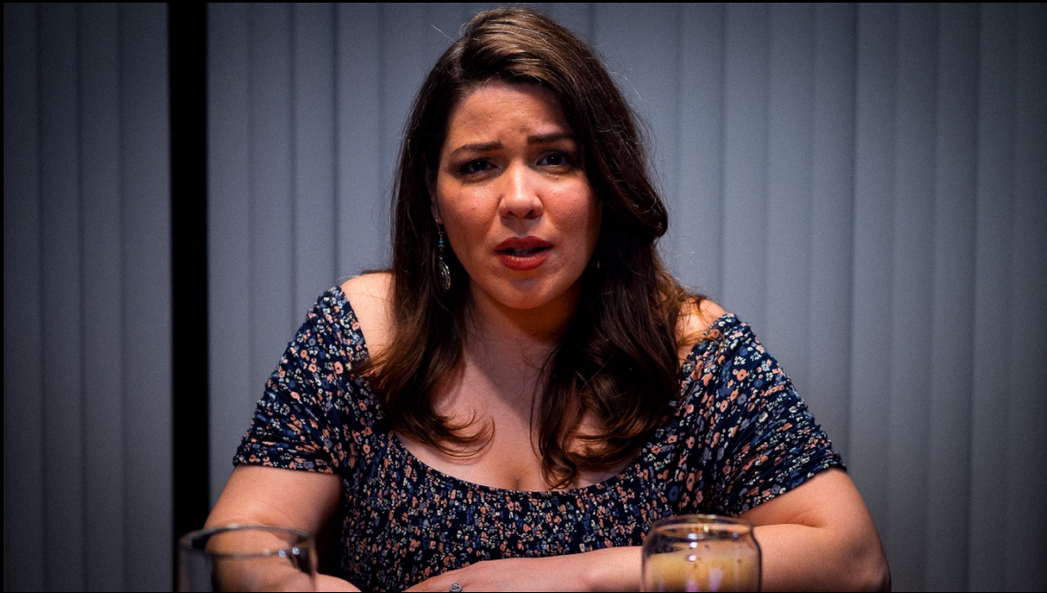
Cindy is suspicious of the new guest and his strange companion.