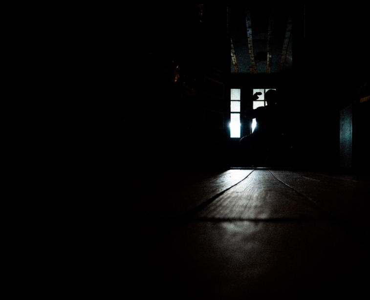
The Sock threatens Uncle Avery, revealing its evil plan.