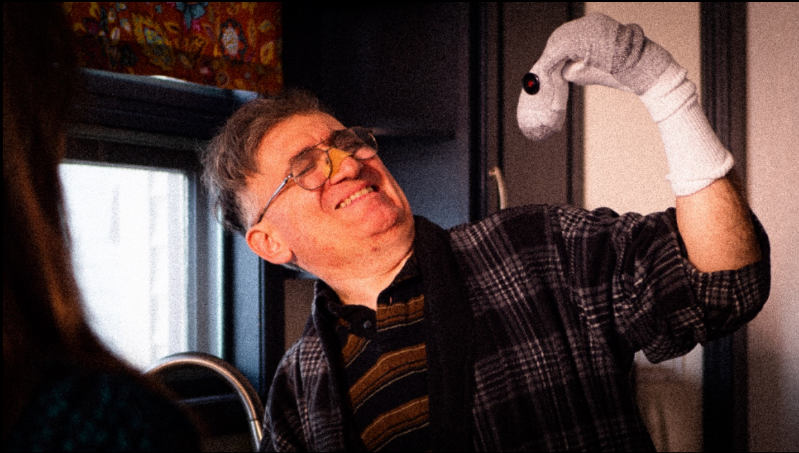
The Sock tries to intimidate Uncle Avery.