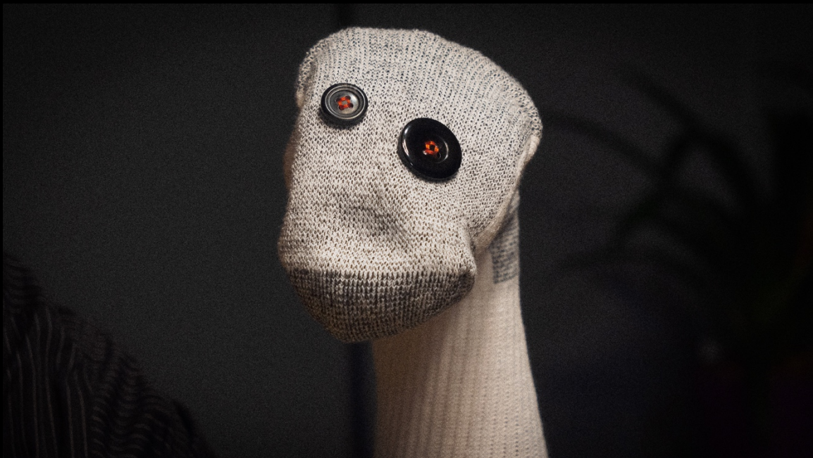
Uncle Avery's companion, a mysterious Sock Puppet.