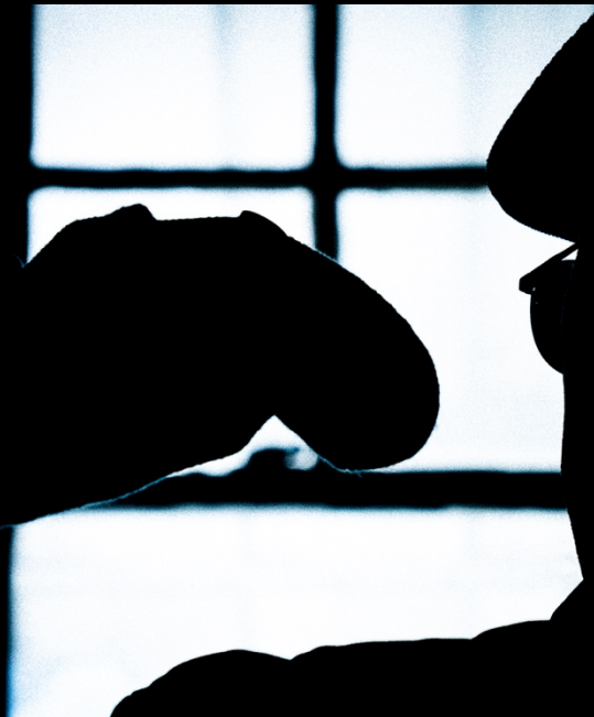
The Sock threatens Uncle Avery, revealing its evil plan.